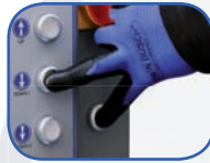
NEW: ANTI LIFT UP-Button