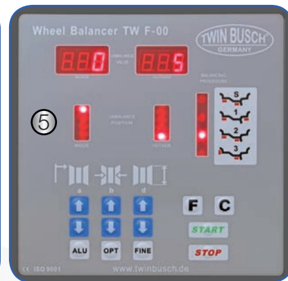
(1) Side holder for centering cones and gauge (2) Integrated distance measurement (3) Quick release nut \varnothing = 40 mm (4) 15 storage compartments (5) Digital Display (The new, compartment design ensures maximum user comfort and optimal ergonomics)