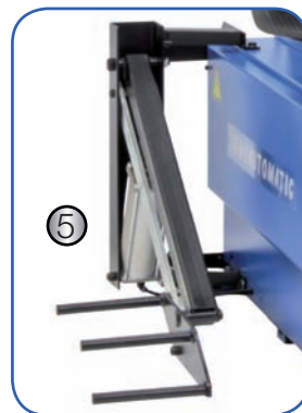
(1) Help-arm for professional use (2) Mounting head (3) Comfortable and clear tire inflator (4) Self centering wheel mounting system (5) Wheel lifter