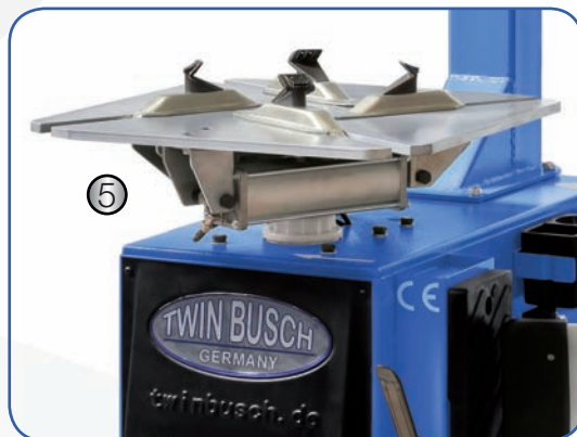
(1) Strong tyre press (2) Eccentric clamping (3) Mounting head (4) Comfortable foot pedal (5) Wide clamping range