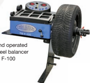
Hand operated Wheel balancer TW F-100

TW X-610 + TW F-100 also available as a set!